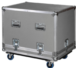
CASE-TS1XTIC transport case