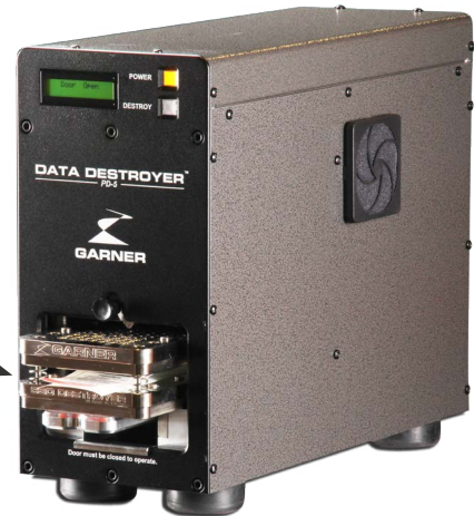
PD-5 with SSD-1 in the destruction chamber