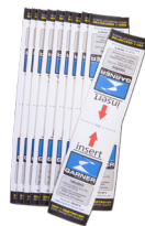
SSD-MT media transport sleeves