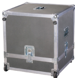
CASE-25SSDIC Transport Case